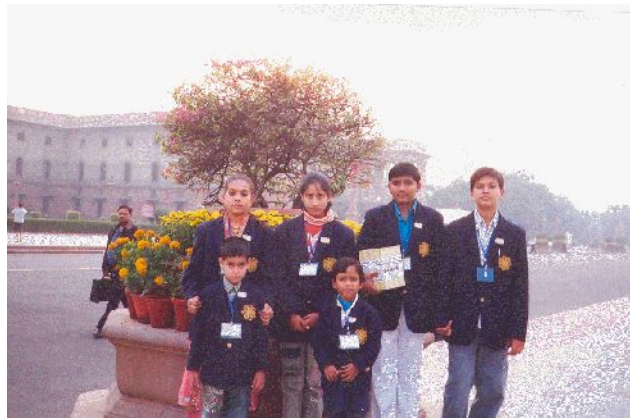
Invited children participated on Flag Day 2008

“They become an easy prey to the propaganda of anti-social elements and the obscurantist fundamentalist forces of reaction. To protect the interest of such children, look after their welfare and in particular their education, the Government proposes to set up a National Foundation for Communal Harmony as an autonomous non-government organisation.”